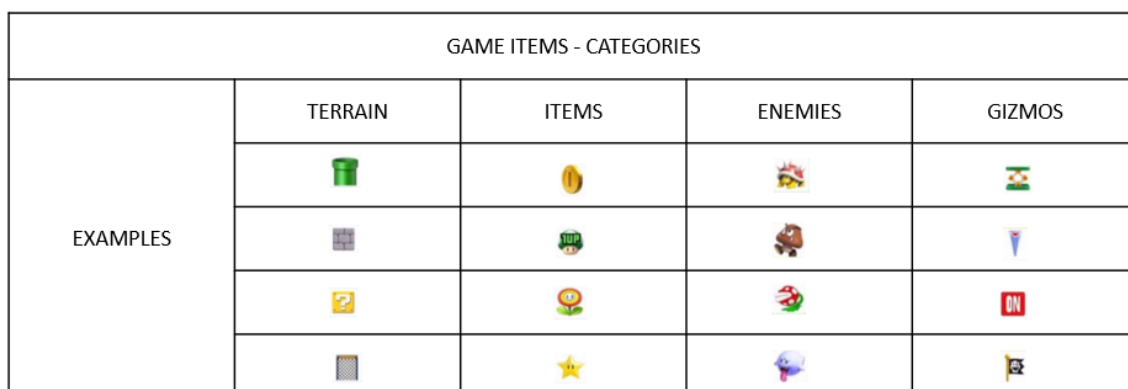
Table 1: Game items categories in SMM2 .

How these game items are placed in the level defines the game play and the obstacles that Mario, controlled by the player, must get pass in each level. The main objective is that Mario reaches the end of each level without dying (too often). In the level shown in Figure 1, for instance, Mario must keep clear of the stalactite-shaped artefacts because they are deadly and fall to the floor after a lapse of time. Mario needs to jump on the top of the column, with the help of the jump booster in the vapour, at the right moment to avoid collision with the falling iced stalactite.