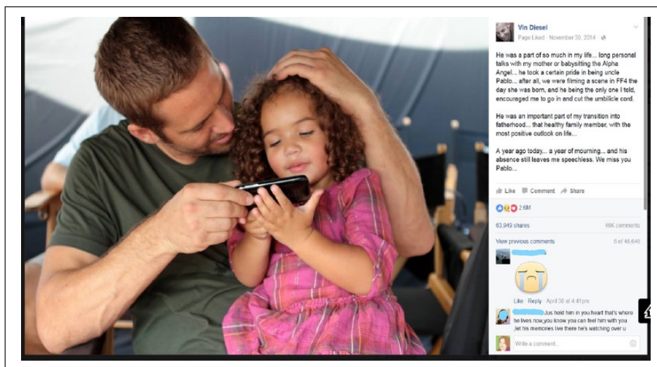
Image 2. Post B – posted a year after the death of Walker. Screenshot from Vin Diesel’s public Facebook profile. Posted November 30 th , 2014.

is also apparent in some of the quotes, I present below, which I have chosen to present exactly as they have been written, in order to convey how people also sometime struggle with expressing their emotions properly in a language which is not their own. While it is impossible to check for the nationality of all commenters in such a big sample, the use of language or explicit references to the commenter’s nationality (“Brasil loves you!”) gives a good indication of the global popularity of VD. Thus, the 1800 comments included comments from people in Russia, India, The Philippines, Thailand, Vietnam, China, Rwanda, Brazil, Italy, Spain, Turkey, England, the US, France, Germany, Nicaragua and Hungary.