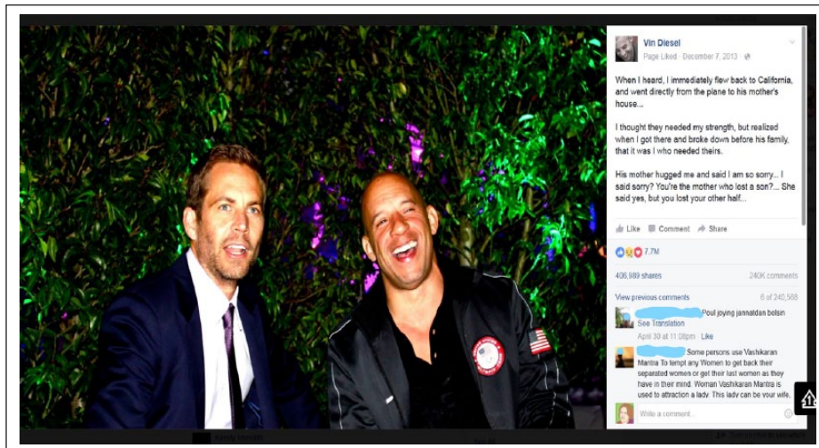
Image 1. Post A – posted shortly after the death of Walker. Screenshot from Vin Diesel’s public Facebook profile. Posted December 7 th , 2013.