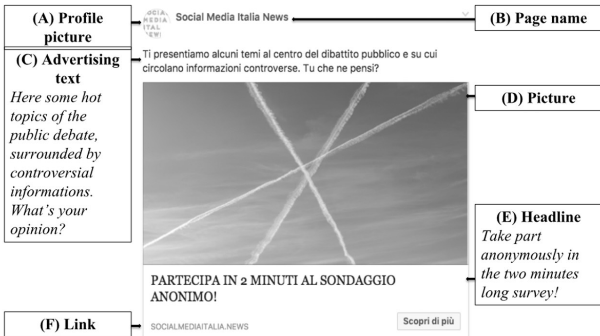
Figure 1. Template for the Facebook advertisement, as it appears in the desktop view on computers.