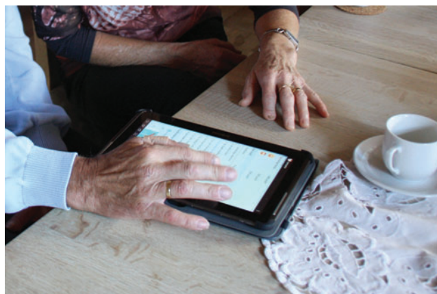
FIG. 3. A patient and his wife using “The Heart Game” on a tablet computer. (Color images available at www.liebertonline.com/g4h )