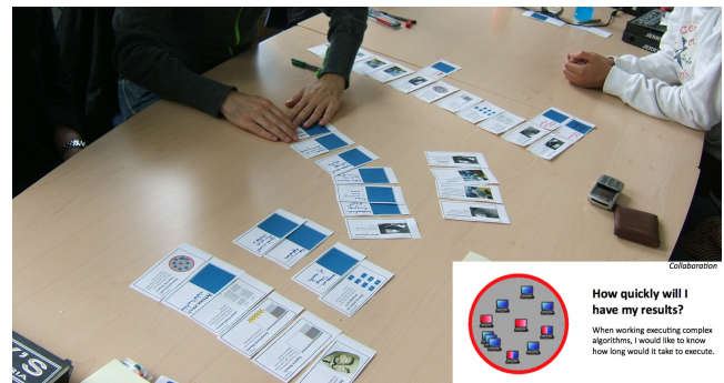
Figure 3. Topical organization of focus cards

Our second core observation was, that the mapping of focus