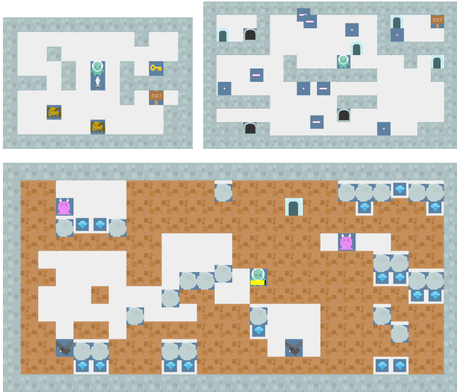
Fig. 2: A visual representation of a few of the VGDLE example games. From top-left: Zelda , Portals and Boulderdash

time avoiding lasers. Seaquest Based on Seaquest . The avatar is a submarine that rescue divers and avoids sea animals that can kill it. The goal is to maximise score. Survive Zombies The player has to flee zombies until time runs out, and can collect honey to kill the zombies. Whackamole Based on Whack-a-Mole . Must collect moles that appear from holes, and avoid a cat that mimics the moles. Zelda Based on Legend of Zelda . The objective is to find a key in a maze and leave the level. The player also has a sword to defend against enemies.