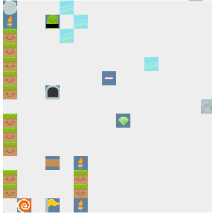
Fig. 3: Visual representation of one of the 400 randomly generated VGDL games

to increase the proportion of interesting outcomes. The number of sprites, interaction, and termination rules were randomly chosen, limited to 25, 25, and 2, respectively. A simple level (only containing one of each sprite) was generated for each of the generated games for test purposes.