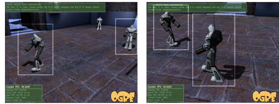
(b) Robots facing same direction (c) Robots facing opposite directions