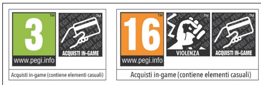
FIG. 2. The Current Italian PEGI Generic “ACQUISTI IN-GAME” and Dedicated Loot Box “Acquisti In-Game (Contiene Elementi Casuali)” Content Descriptors. Color images are available online.