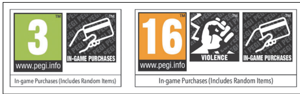
FIG. 1. The Current English PEGI Generic “IN-GAME PURCHASES” and Dedicated Loot Box “In-game Purchases (Includes Random Items)” Content Descriptors. © 2020 PEGI (Pan-European Game Information) Color images are available online.