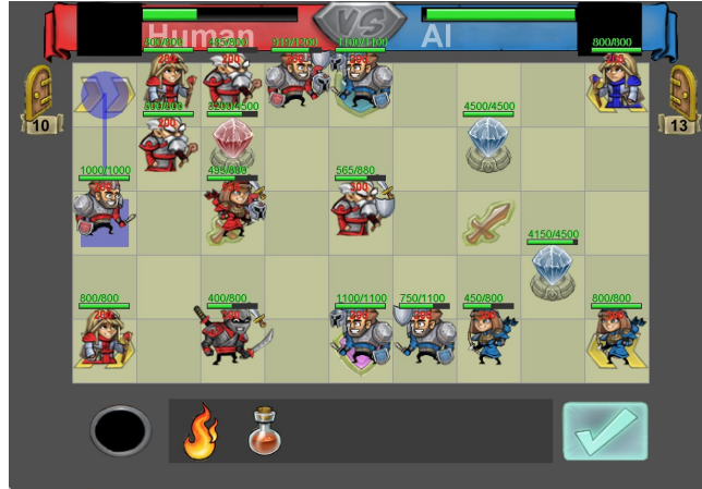
Fig. 1: A typical game state in Hero Academy. The screenshot is from our own implementation of the game.

the resulting game state of each action, but this is usually a slow method. The method we implemented rates an action by how much damage it deals or how much health it heals. If an enemy unit is removed from the game, it is given a large bonus. In the same way, healing actions are awarded a bonus if they are saving a knocked out unit. In this way, critical attack and healing actions are rated high and movement actions are rated low.