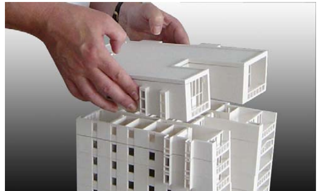
FIGURE 4 Layered plaster model

The model can be cut in pieces or made in parts and opened up to look at the construction in side. In the virtual model people can move around inside a building by using a computer. These kinds of models specifically reveals the spatial consequences of the design and can thus be used to get a feeling of the final result and help in discussing different solutions with the customer. This can thus be seen as an additional service to the customer.