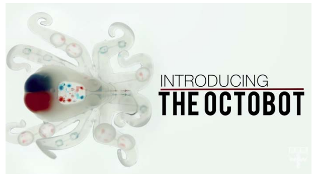
Figure 1: Still image from the opening shot of the first video.