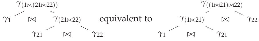
Figure 7.2: Context Joins

[\delta_1, \delta_2 \vdash \text{lapp} \wedge (\text{l1am} \wedge (\widehat{\lambda}x. N')) \wedge M'] . Furthermore, we have deliberately chosen the subscripts for our context variables to emphasize their encoding in our underlying theory. Note that all context variables that belong to the same tree of context splits have the same name, but differ in their subscripts. The context variables \gamma_1 and \gamma_2 are called leaf-level context variables . The context variable \gamma_{(1 \bowtie 2)} is their direct parent and sits at the root of this tree. One can think of the tree of context joins as an abstraction of the typing derivation.